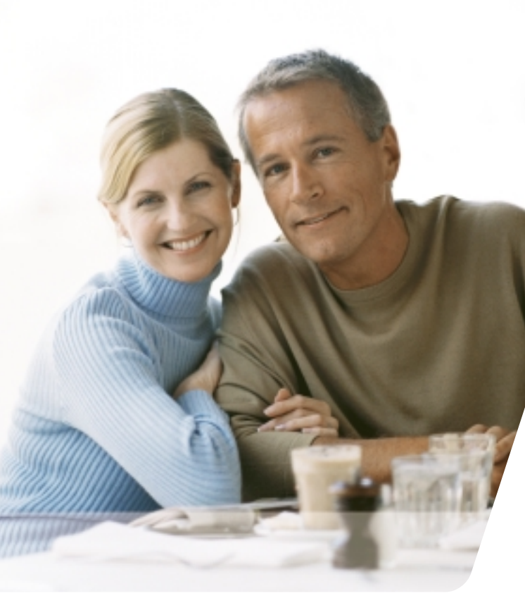
Issue 7d - 1 August 2003. Expires 31 December 2003.

A simple way to protect you & your family's future Customer Information Brochure